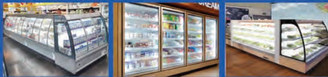
ADVANZA SEMI VERTICAL GLASS DOOR