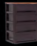
WAJ534 B 4 Layers, Brown 590x440x825