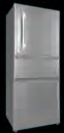
MR3BF-238J (8.4 cuft), 120W 575x580x1779mm