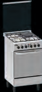
MRGS50 (BATALI) Stainless Steel Finish 62L Oven Capacity 500x550x850mm