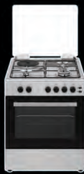
MGR-60SSTS Stainless Steel Finish 63L Oven Capacity 600x500x850mm