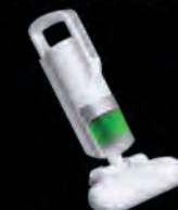
IC-FAC2 250x459x212mm Sofa, Mattress Cleaner