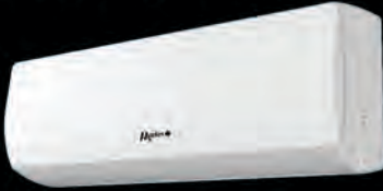
MSW-09XET (1.0HP) 822W, 698x225x190mm MSW-12XET (1.5HP) 1190W, 777x250x201mm MSW-18XET (2.0HP) 1683W, 910x292x190mm