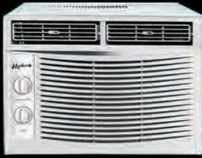
MWA-06GM4T (0.6HP) 570W, 407x401x319mm