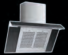
MSRH-0612 Touch Control