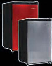
MRS-88RJ / SSJ (3.1 cuft), 70W 480x495x825mm