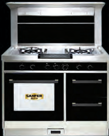
MSIC-G4N1 | MSIC-S4N1 60L Oven Capacity 1000x600x1300mm