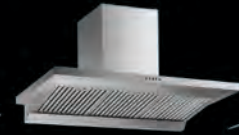
MRH-1690T Stainless Steel Air Flow: 800m 3 /hr 900x500x393mm