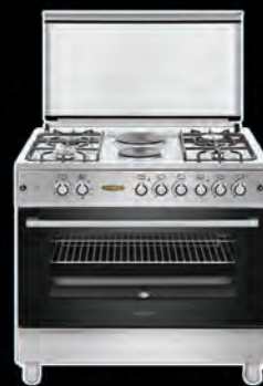
MGR-90SSF Stainless Steel Finish 110L Oven Capacity 900x600x850mm