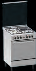
MRFS60 (GARCES) Stainless Steel Finish 80L Oven Capacity 600x600x850mm