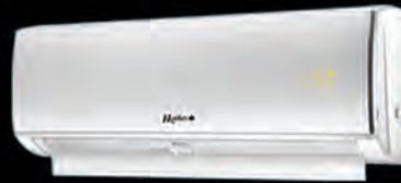
MSWI-09XAT (1.0HP) 785W, 698x190x255mm MSWI-12XAT (1.5HP) 1140W, 777x201x250mm MSWI-18XAT (2.0HP) 1682W, 910x201x294mm MSWI-24XAT (2.5HP) 2800W, 1010x315x220mm