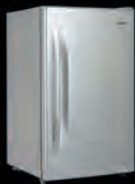
MRS-118GJ / WJ (4.1 cuft), 120W 582x550x845mm