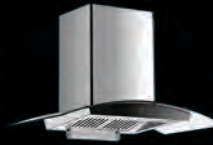
MRH-3090T Stainless Steel Air Flow: 1000m 3 /hr 900x500x575mm