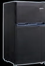
MRT-85BKJ (2.7 cuft), 85W 480x445x845mm