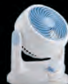
PCF-HD15 241x175x292mm w/ Swing function