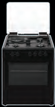
MGR-50BKTS Black Enamel Finish 40L Oven Capacity 500x500x850mm