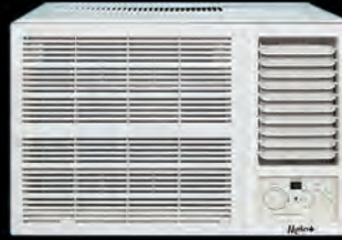
MWA-07GM4T (0.75HP) 728W, 470x535x355mm MWA-09GM4T (1.0HP) 946W, 470x535x355mm MWA-12GM4T (1.5HP) 1225W, 600x560x380mm MWA-18GM4T (2.0HP) 1744W, 680x660x430mm