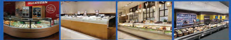
DANAOS ROUND CORNER COUNTER