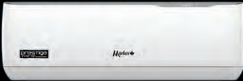
MSWI-09META (1.0HP) 867W, 788x292x198mm MSWI-12META (1.5HP) 1100W, 940x316x224mm MSWI-18META (2.0HP) 1800W, 940x316x224mm MSWI-24META (2.5HP) 2100W, 1132x330x232mm