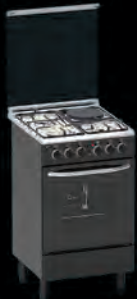
MREB50 (BOURDAINE) Black Enamel Finish 62L Oven Capacity 500x550x850mm