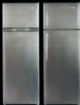
MRTI-260RJ / HJ (8.8 cuft) Rated Power: 102W, 550x580x1645mm