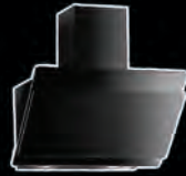
MRH-1090T Black Tempered Glass Air Flow: 750m 3 /hr 900x462x424mm