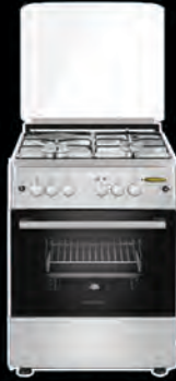
MGR-58SSF Stainless Steel Finish 62L Oven Capacity 580x580x850mm