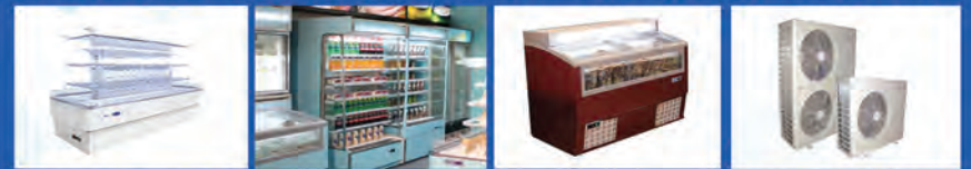
PLEASURE AND ADVENTER REMOTE CASE