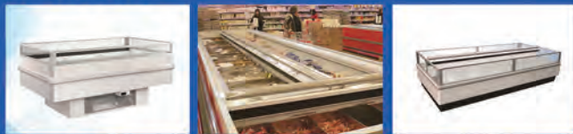
PLUG-IN ISLAND CASE