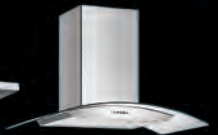
MRH-1890T Stainless Steel Air Flow: 800m 3 /hr 900x500x360mm