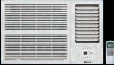
MWA-07HR4T (0.75HP) 728W, 470x535x355mm MWA-09HR4T (1.0HP) 910W, 470x535x355mm MWA-12HR4T (1.5HP) 1163W, 600x560x380mm MWA-18HR4T (2.0HP) 1744W, 660x680x430mm