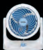
PCF-HD15N 241x175x266mm No Swing Function