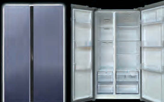
MRTI-540S (19.9 cu.ft.) Rated Power: 210W, 911x691x1780mm